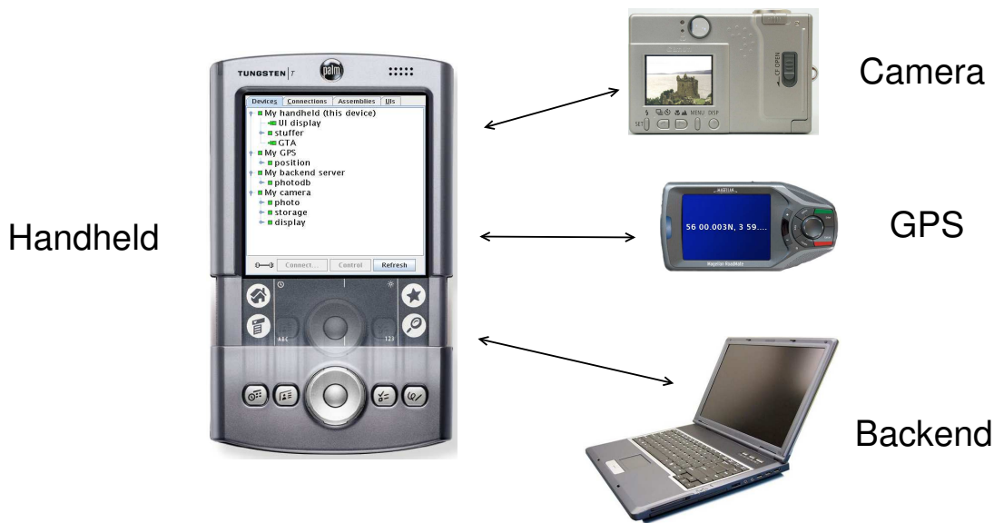
Fig. 3. The GeoTagger scenario

and dynamically. In the static part, the name and type analysis is extended to the local variables. In the dynamic part, it is checked that the bound services actually have the incoming and outgoing messages used in the script, with the appropriate message structure.